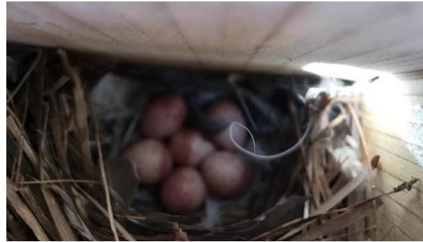
House Wren eggs - pink w/specks, Jane