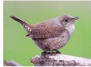
House Wren -