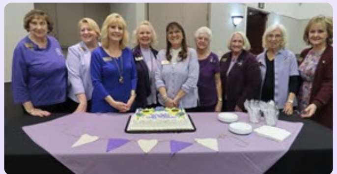
Past and Present Presidents