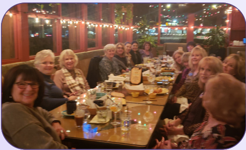
YLWC ladies enjoyed a Socialite dinner at El Cholo.