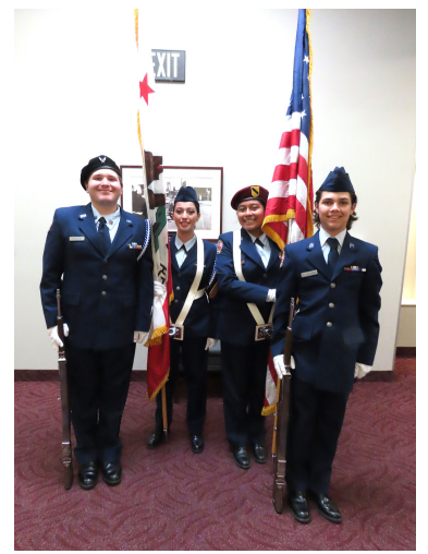
Color Guard from the Junior Air Force ROTC from Esperanza High School