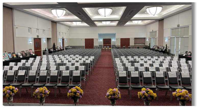
The Calm Before the Storm