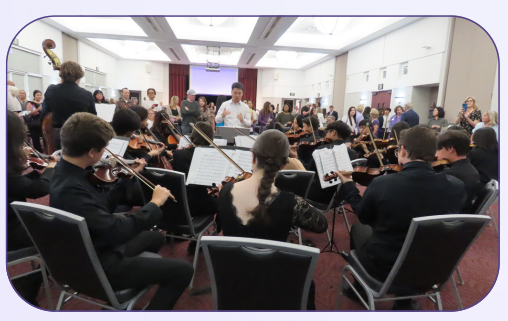
Esperanza High School Sinfonia Orchestra