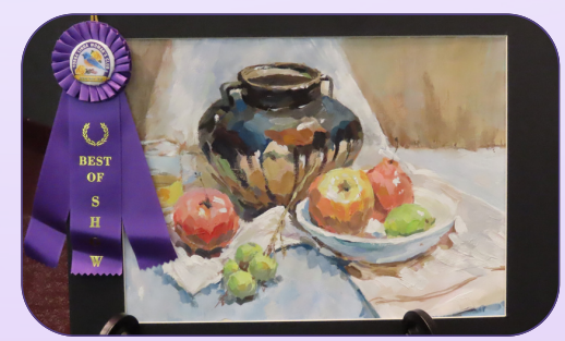
Best of Show