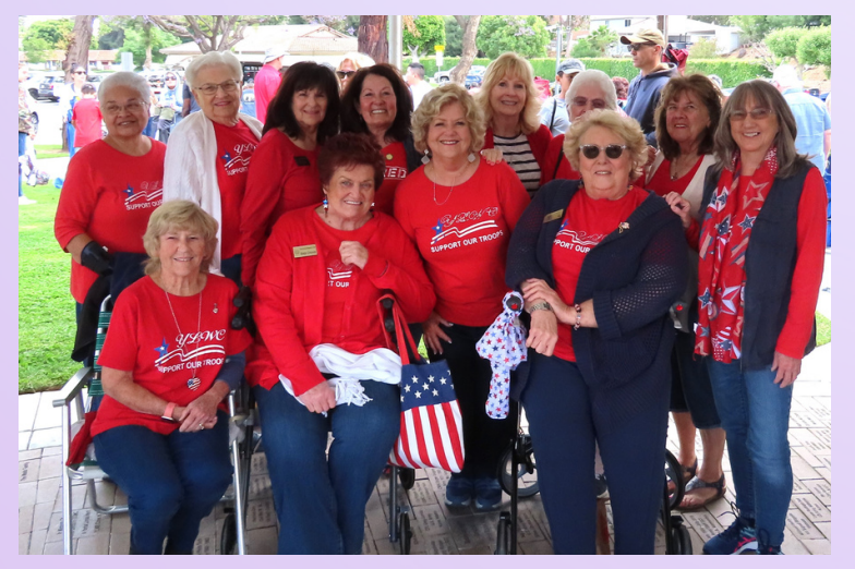
YLWC pays tribute on May 29th at a Memorial Day Ceremony at Yorba Linda Veterans Memorial Park.