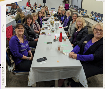
YLWC members at the Orange District Meeting.